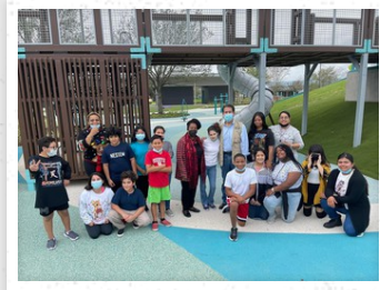
Meeting Community Leaders!