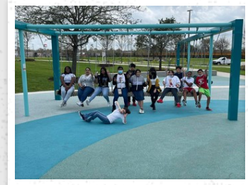
Enjoying Our New Park!

"What a wonderful thought it is that some of the best days of our lives haven't even happened yet." Anne Frank