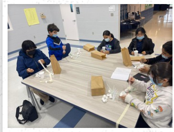
Egg Drop Challenge!